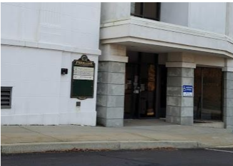
Once in the building, take the elevator or stairs to the 2nd floor